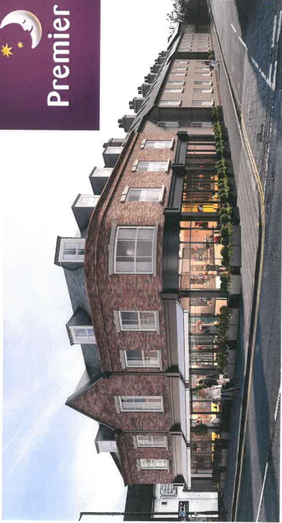
Barnet Hotel, Restaurant and Bar