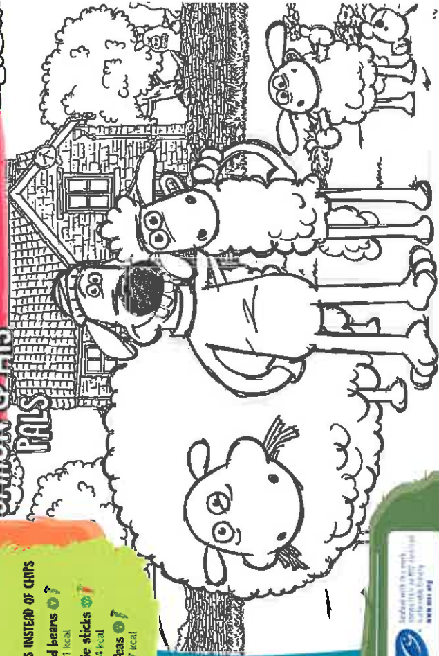
Finished colouring in already! Ask a member of the team for more Shaun the Sheep colouring in sheets.